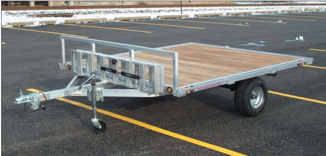
Model: WATV-NR Shown with Options